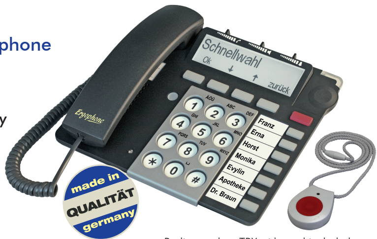
Radio pendant TRX with cord included

The „Ergophone S 510 radio“ meets high standards of quality, flexibility and reliability. Due to the consistently ergonomics, the operation is intuitive and easy. The phone can be expanded by numerous radio units to a comprehensive security system. Special versions of the phone allow the integration of wired call triggers like pear- or cord pull switches.