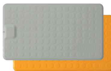
CareMat® TRXB as a door mat, 70 x 40 cm