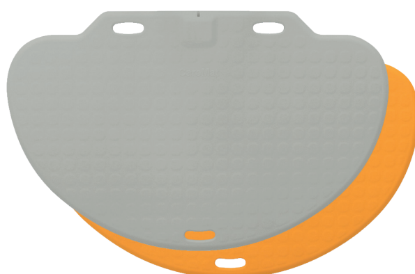
CareMat® TRXC as a bedside rug, 110 x 70 cm