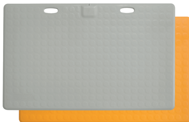
CareMat® TRXA as a bedside rug, 110 x 70 cm