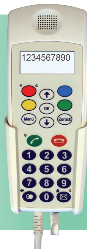
CP 200 with receptacle